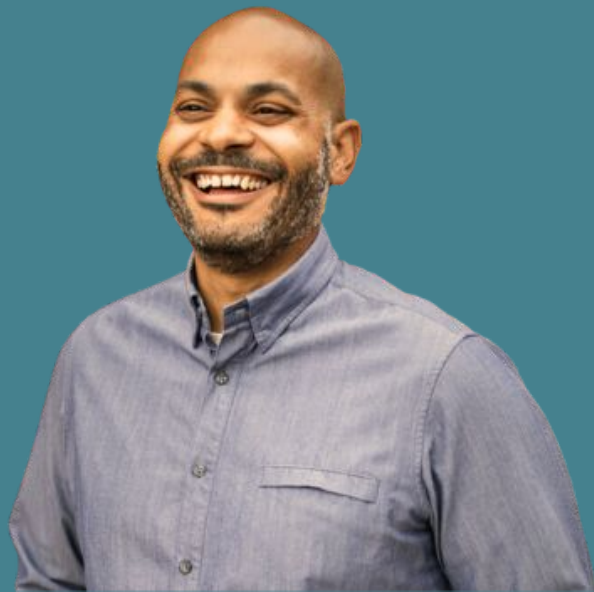
City Council President Elliott Payne