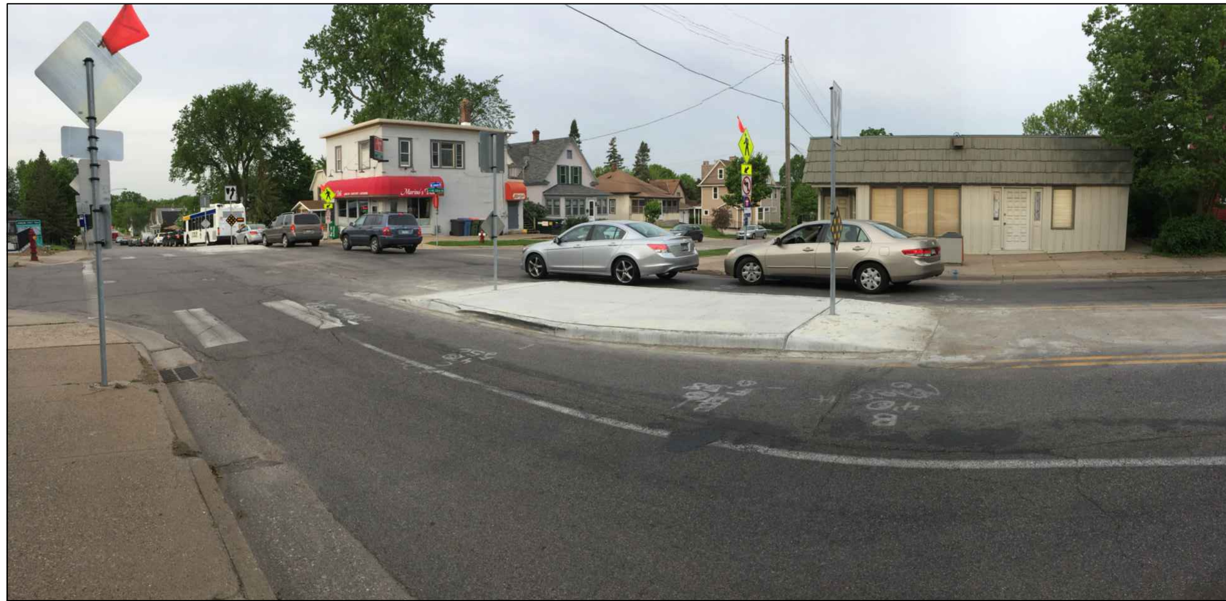
2 EXISTING CONCRETE TRAFFIC DIVERTER