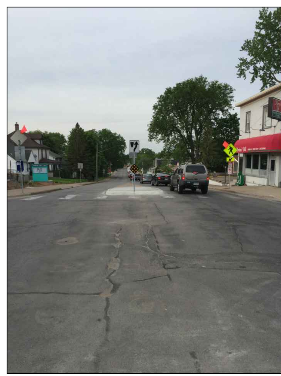
1 EXISTING CONCRETE TRAFFIC DIVERTER