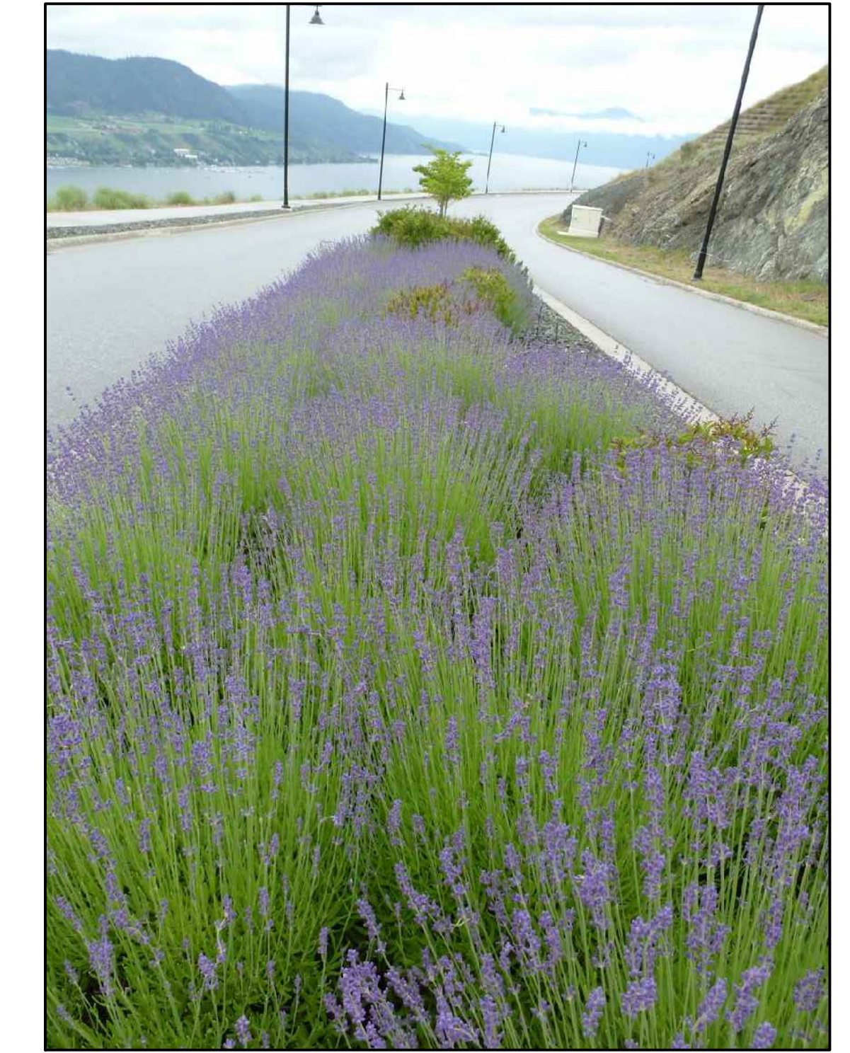
4 PLANTED MEDIAN