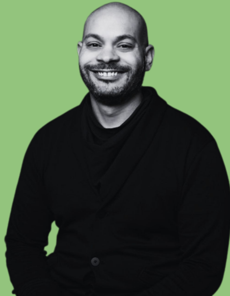
City Council President Elliott Payne